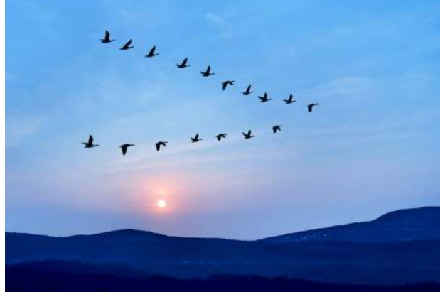
Figure 1: Networks of agents in which part of them are leaders and the remaining part are followers.